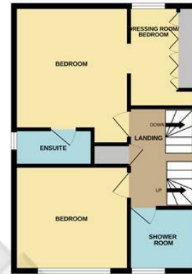
1ST FLOOR 482 sq.ft. (44.8 sq.m.) approx.